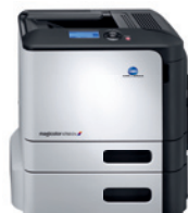
magicolor 4750EN magicolor 4750DN with optional lower paper feeder