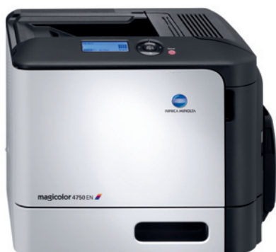
magicolor 4750EN magicolor 4750DN standard